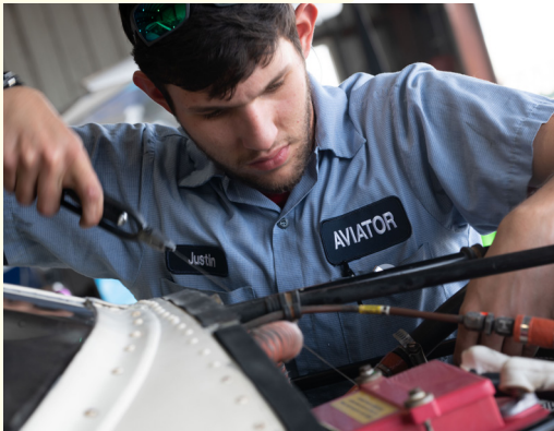
Aviator College, Mechanic TCIA