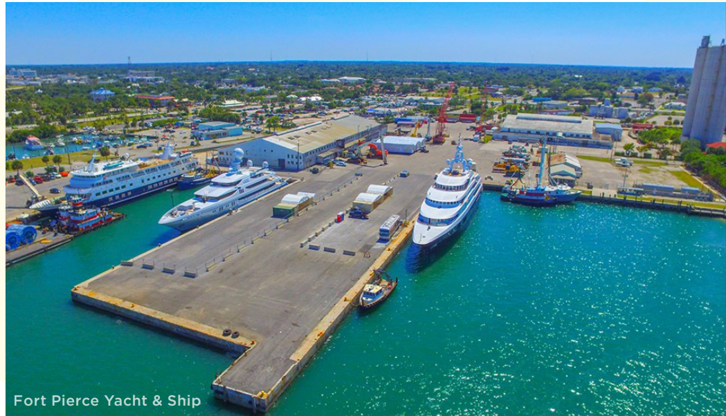
Fort Pierce Yacht & Ship

Construction is underway on the new MRO hangar at the Treasure Coast International Airport. Standing 57 feet tall with a 43-by-130-foot door, the new MRO hangar will comfortably accommodate two large aircraft.....Aviator College of Aeronautical Science and Technology is expanding its airport-based campus to produce more maintenance technicians while Indian River State College launched a new Aviation and Marine Training program.....Mega-yachts are coming to the Port of Fort Pierce! The county signed a contract in April with Derecktor Boatyards to refit power and sailing mega-yachts. Local group Fort Pierce Yacht & Ship is already at work on refits at the port.