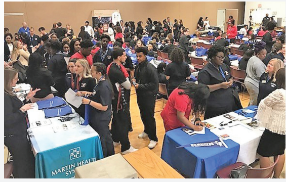
Future Healthcare Professionals of the Treasure Coast

The first State-of-the-Jobs Conference to be offered on Florida's East Coast was a collaboration between CareerSource Research Coast and Workforce Readiness Taskforce stakeholders. Post-secondary education options, career readiness, employability skills and leadership in three distinct career tracks – healthcare, manufacturing and skilled trades – were presented to 435 Treasure Coast high school students.