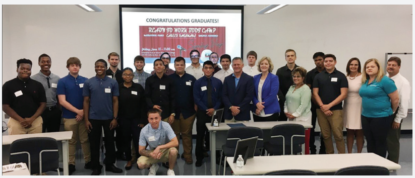
2018 Boot Camp Graduation

The EDC, the Treasure Coast Manufacturers Association and their partners offered another first-ever program to 22 recent graduates of St. Lucie Public Schools. The five-day boot camp was designed to prepare the young people, who were chosen by their guidance counselors, for immediate, high-demand careers. Instruction covered the manufacturing process, quality assurance, packaging, warehousing, distribution, safety and more. The boot camp's graduation included an athlete-inspired signing day with local manufacturing, trade and distribution employers invited to attend and sign the graduates up for employment.