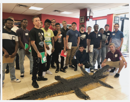
Boot Camp participants touring program sponsor Southern Eagle Distributing's facility