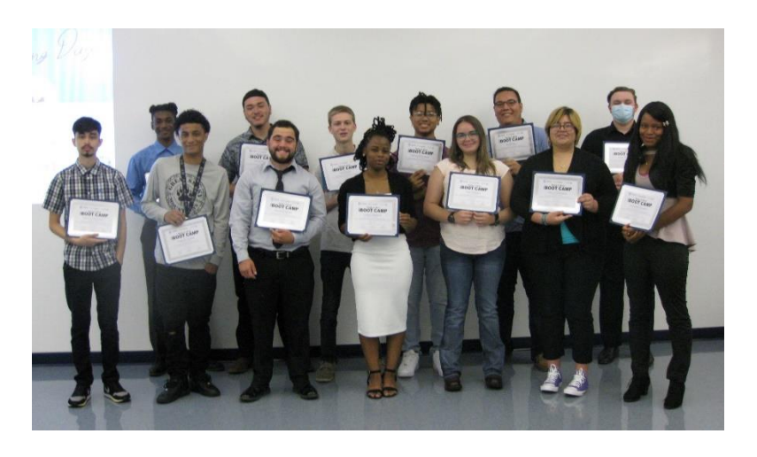
13 recent high school graduates completed the St. Lucie County Ready to Work Boot Camp June 11.